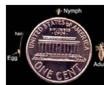
Size of nits and lice compared to a penny